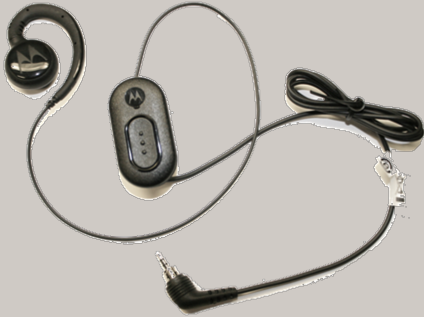
RMN5130A Mono over the ear headset W/MIC & PTT-2.5mm