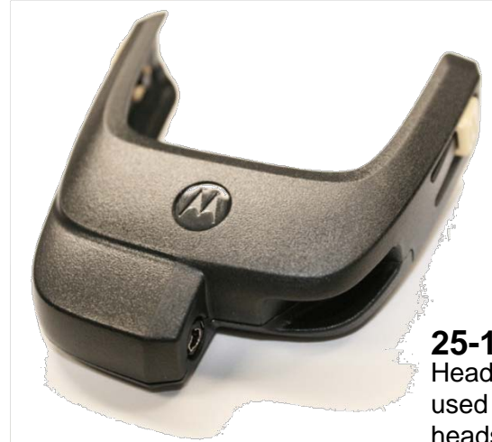
25-154075-01R Headset adapter, to be used with RMN5130A headset for PTT Express.